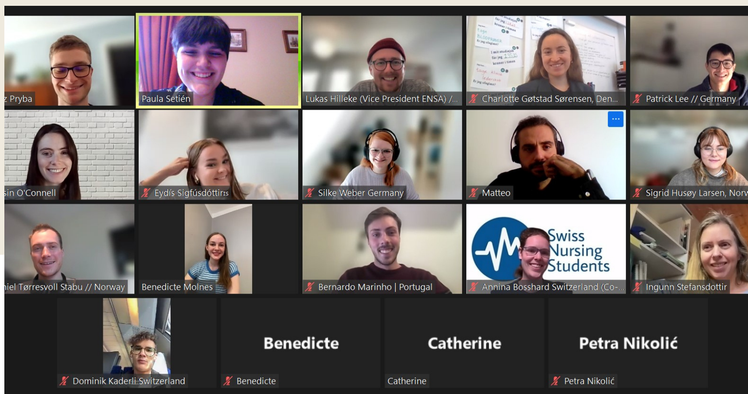
Screenshot AGM on the 10.10.2022